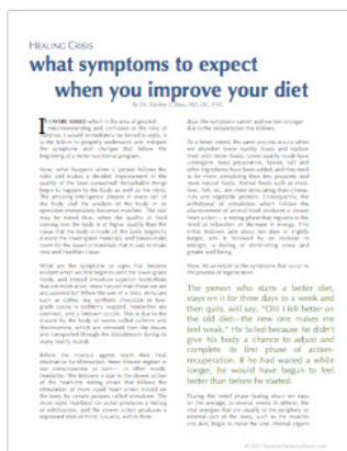
What Symptoms to Expect ...